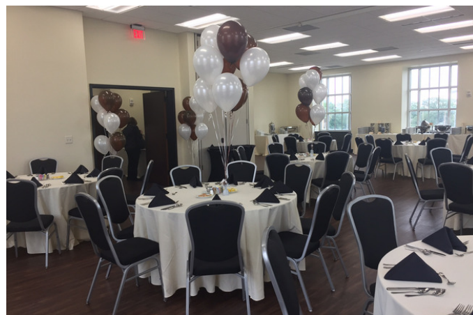
The Huey P Long Conference Room