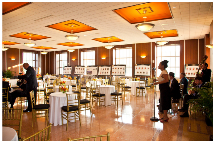
The Walnut Room