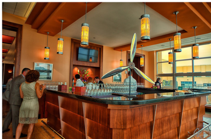
The Walnut Room